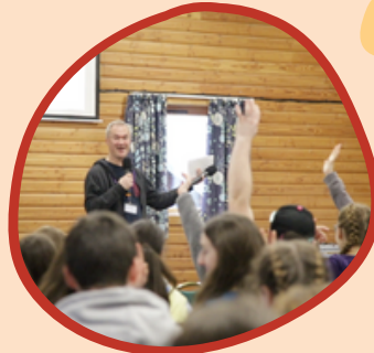
Inspire the Church