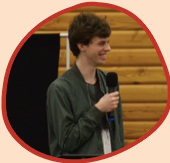
Raise up more leaders