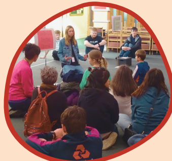
Invest in the next generation